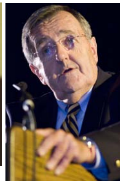
Political Commentator Mark Shields has shared his thoughts with Nyumbani audiences at many fundraisers, including this one in 2007.