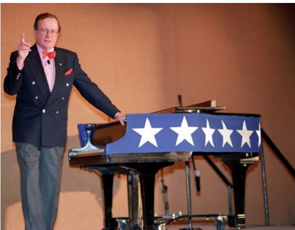
Famous political comedian Mark Russell has kept audiences laughing at many Nyumbani fundraisers. This picture is from his performance in 2002.