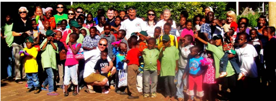
British Airways friends joined the Nyumbani Home crew to celebrate Easter this year.

There is a glimmer of hope in this area from a followup of my visit to the Center for Disease Control (CDC) Atlanta. More evidence of the need for third-line ARVs