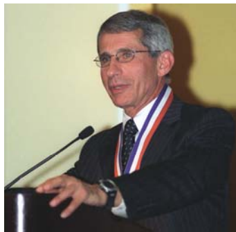
Each event honors people who have helped Nyumbani and the fight against HIV/AIDS. Pictured here in 2009 is special guest and honoree Dr. Anthony Fauci, director of the National Institute of Allergy and Infectious Diseases, National Institutes of Health.

Tommy Thompson in 2004. Thompson was U.S. Secretary of Health and Human Services under President Bush.