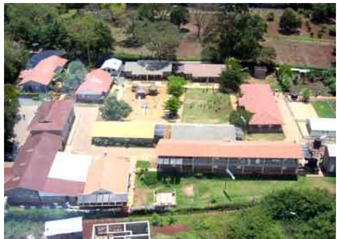
An aerial view of the Nyumbani Orphanage & School, Nairobi, Kenya