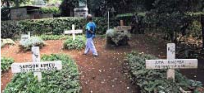
From an early age, death is a part of life for these children.